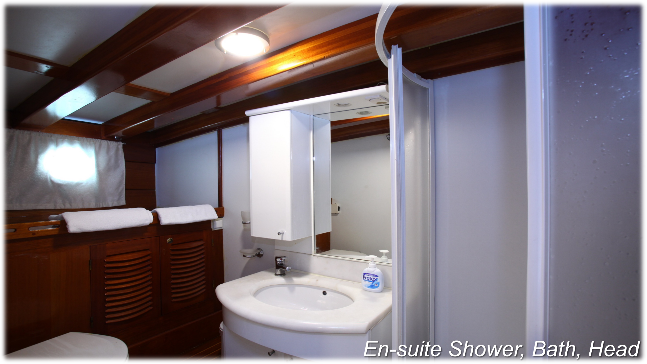
En-suite Shower, Bath, Head