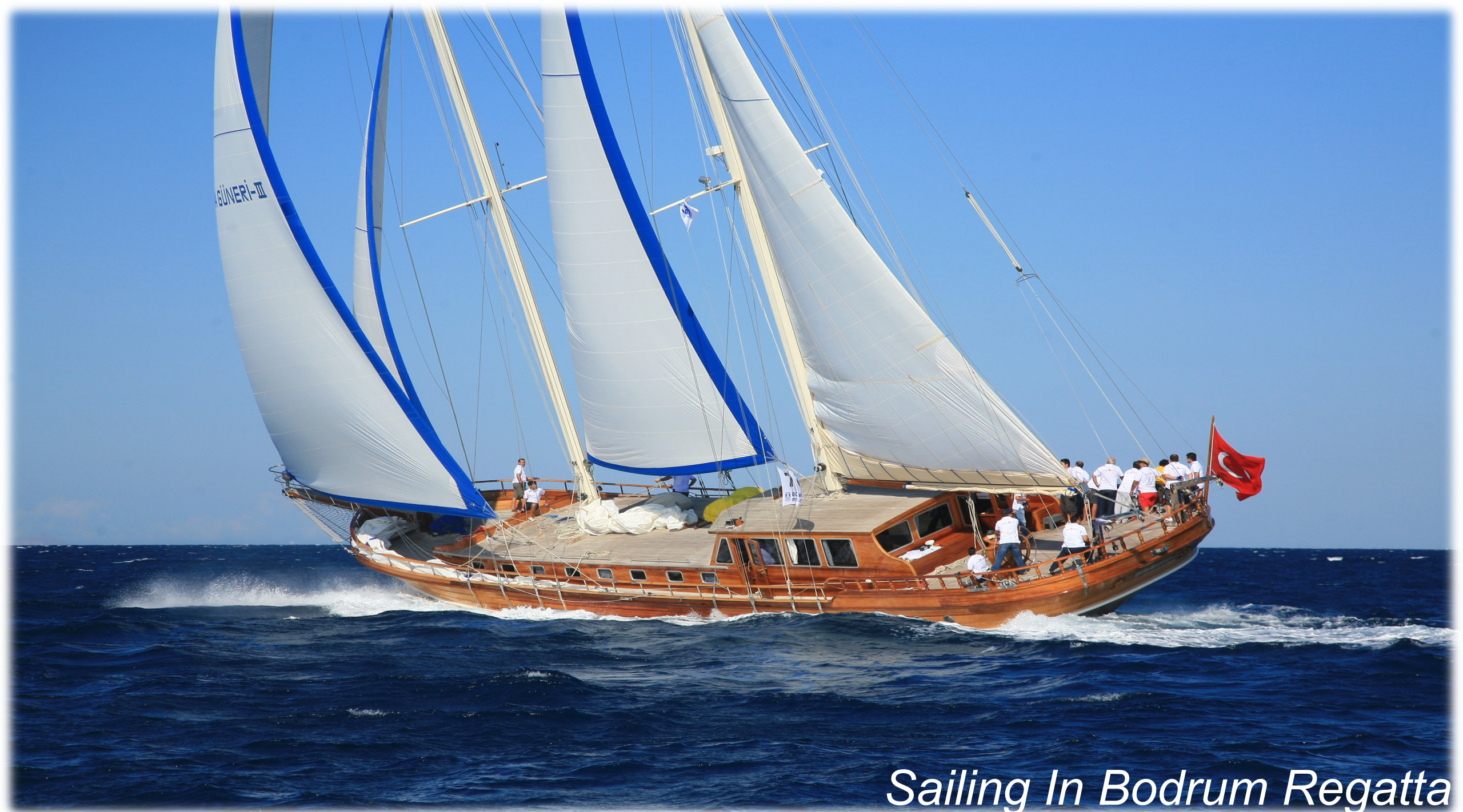
Sailing In Bodrum Regatta