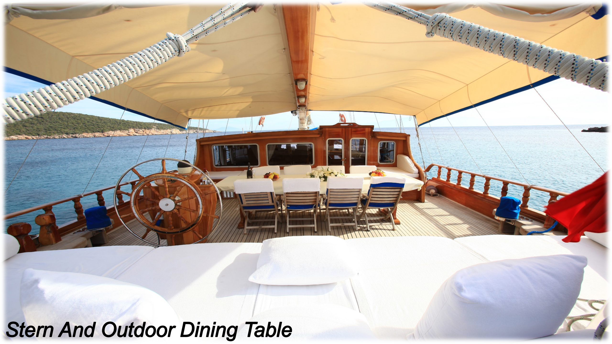
Stern And Outdoor Dining Table