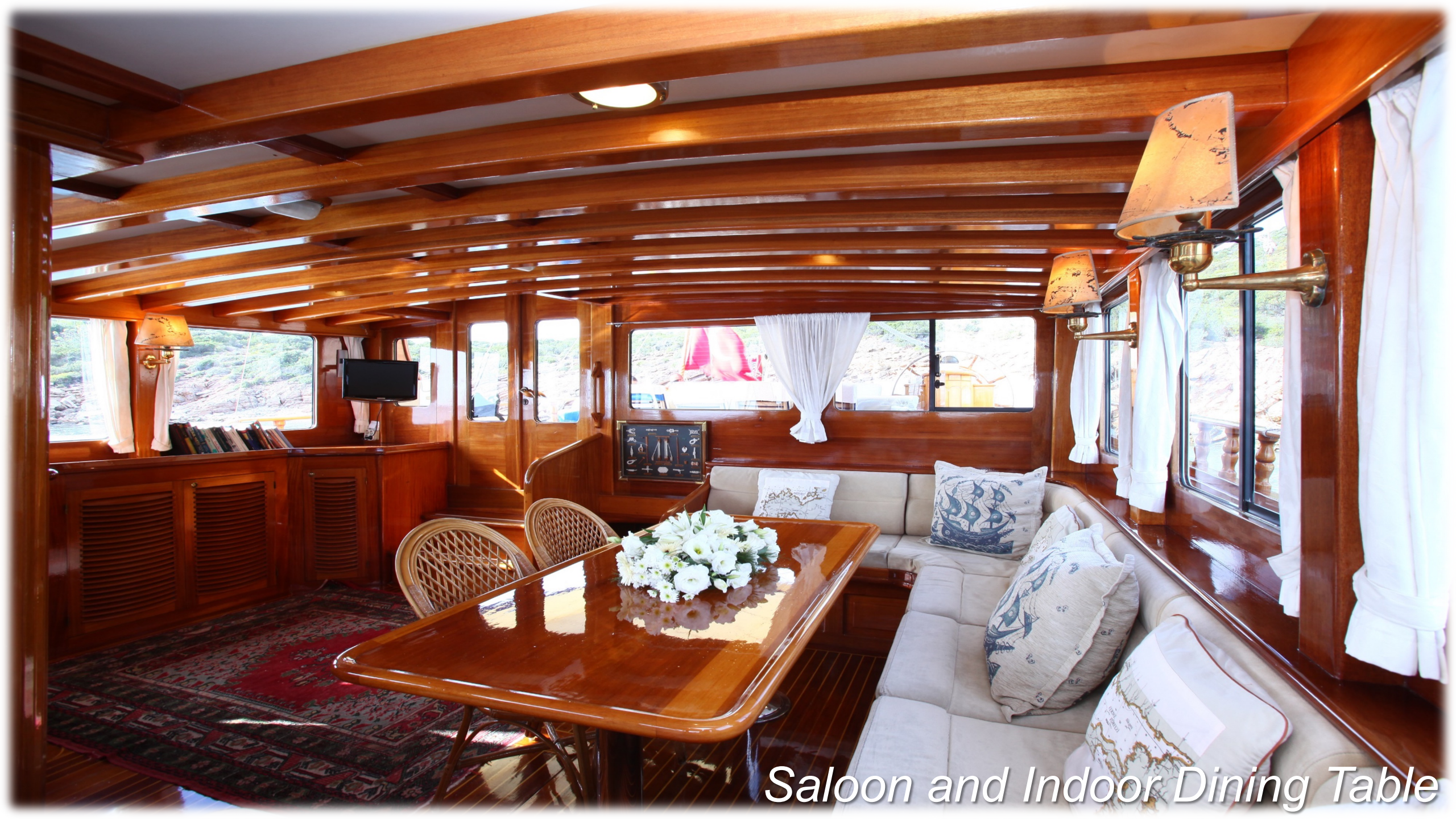
Saloon and Indoor Dining Table