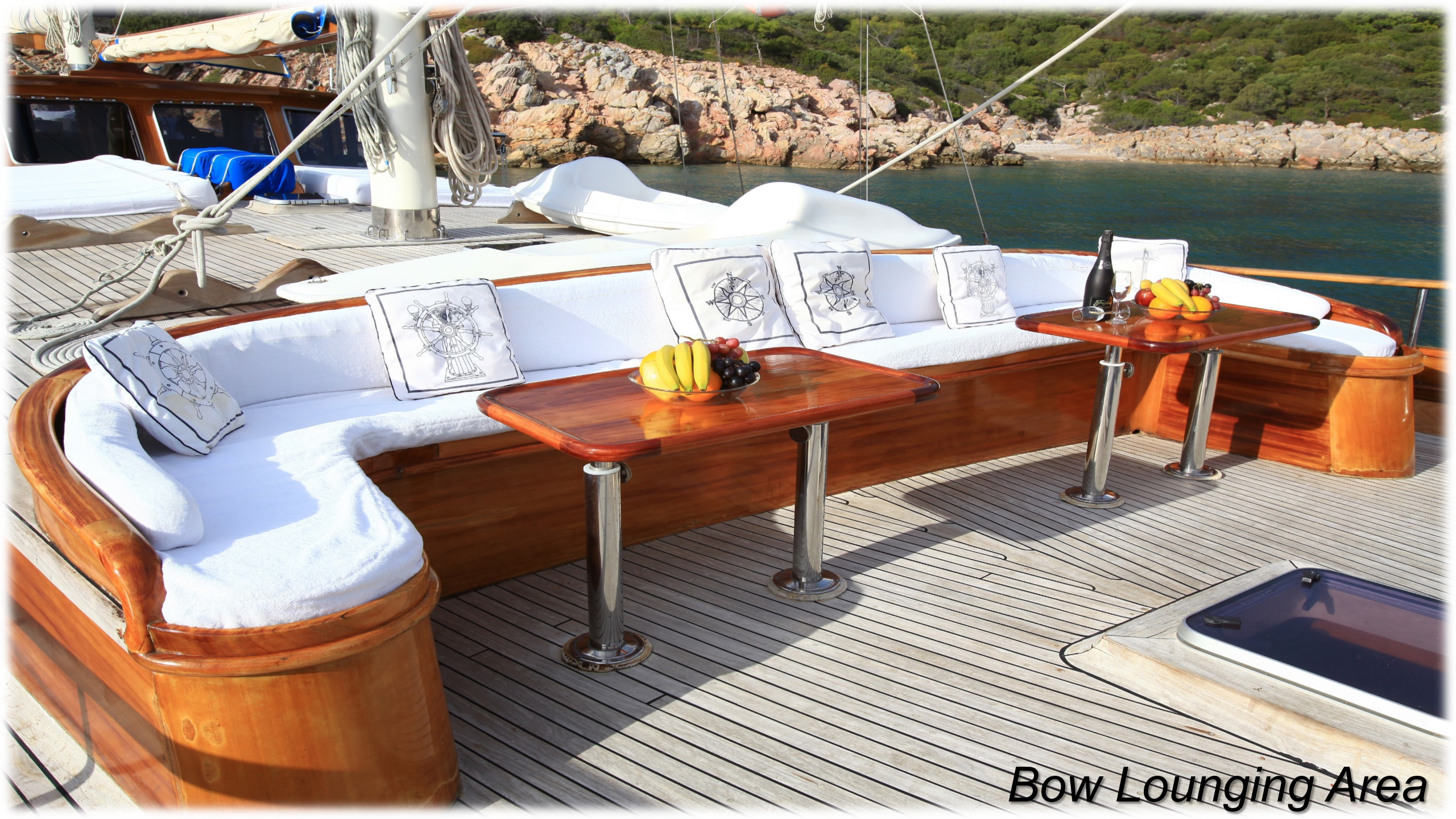
Bow Lounging Area