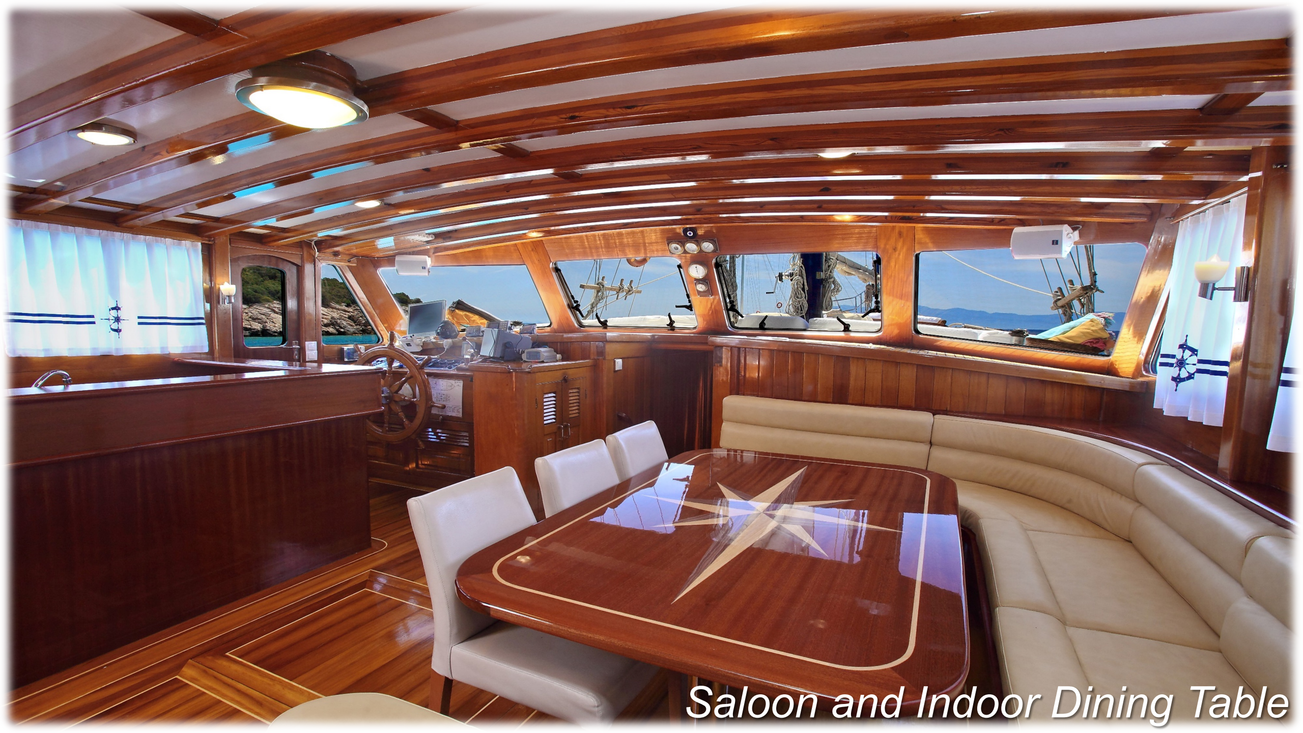
Saloon and Indoor Dining Table