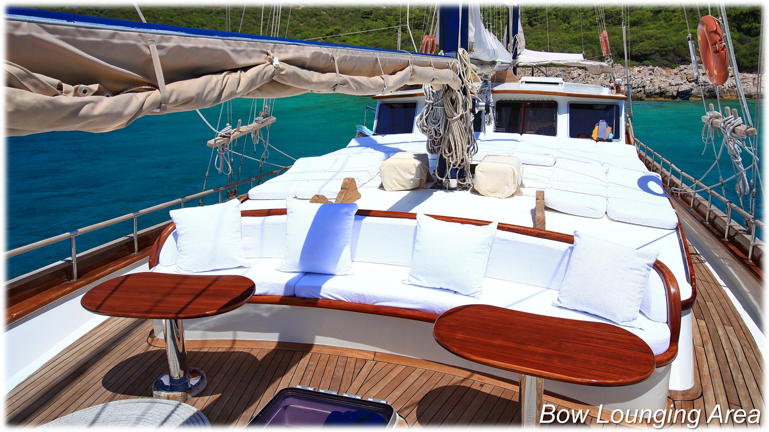
Bow Lounging Area