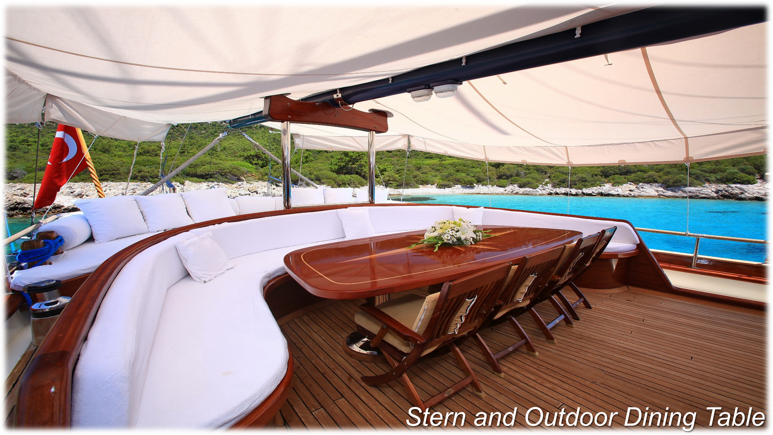
Stern and Outdoor Dining Table