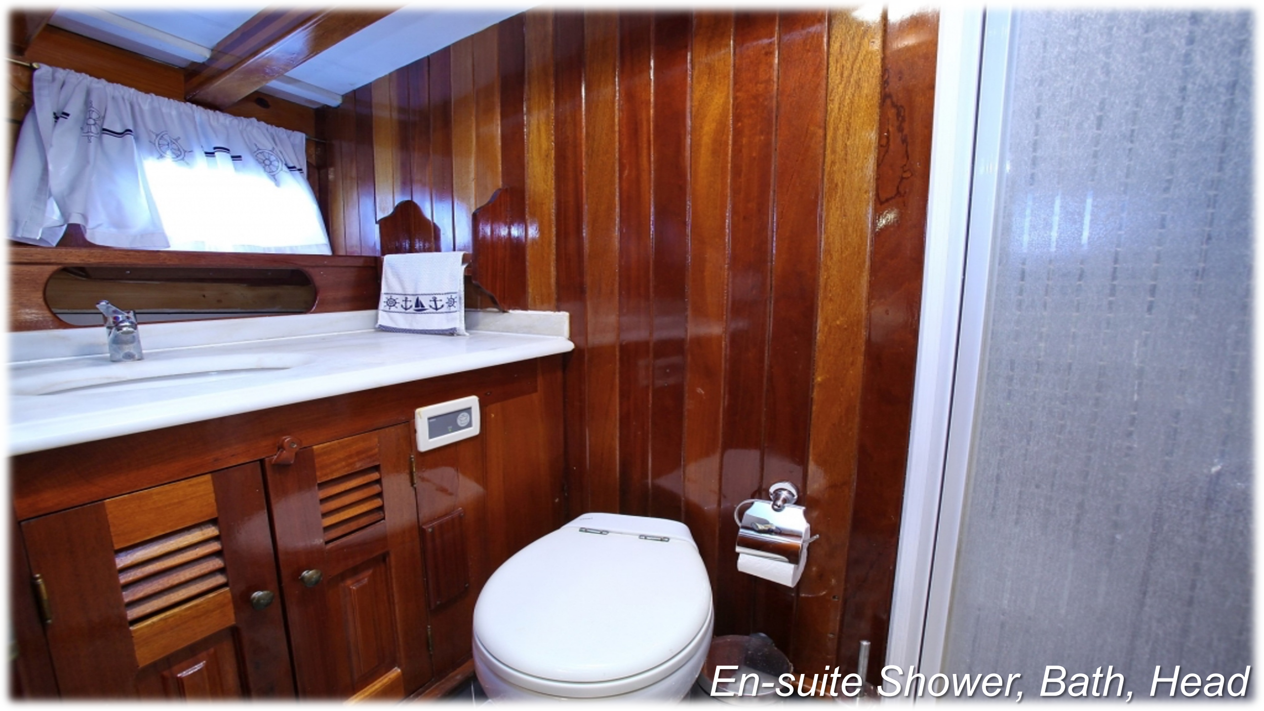
En-suite Shower, Bath, Head